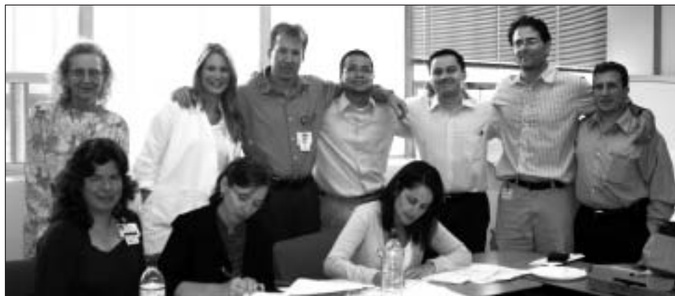
Negotiating team members from Doctors Medical Center in Modesto, CA gather around as the new agreement is signed by representatives of CIR and hospital administration.

Historically, the Family Residency Program at Doctors Medical Center in Modesto, CA has been one of the area's gems. Not only do residents embark on three years of rigorous training, during which they deliver high-quality care to local patients, but also often stay past residency to practice medicine in the Modesto community long-term.