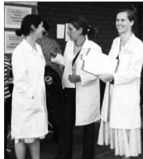
CIR members in (left to right) Santa Rosa, California, discussing access for Californians, and nationwide coverage for

Using the movie Sicko as a starting point for discussions and activism, hundreds of CIR members around the country have been speaking with the audience, leafleting and getting petitions signed at screenings from the west coast to the east. Their goals overall are to improve access to care, with a different focus in each location. In Northern and Southern California, lobbying for statewide universal access was a major goal; in the North, ensuring community access to care in the event of a hospital's reorganization was another focus. In Florida, Massachusetts,