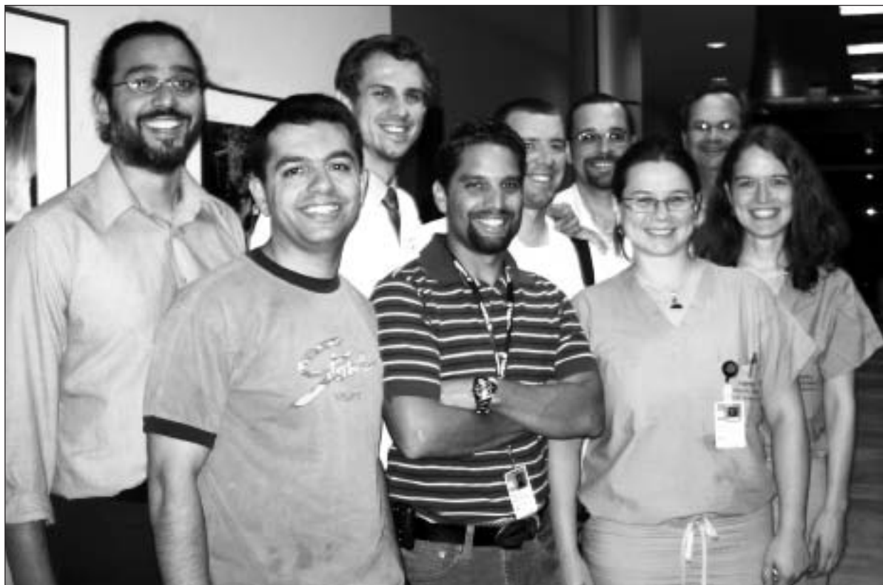
UNM's CIR negotiating team, pleased and relieved following their late night last session, on August 2, 2007.

Residents at UNM voted to join CIR six months earlier, to improve wages and working conditions, and gain a greater voice in patient care and health policy issues. Their first contract makes improvements in all those areas, delivering raises that