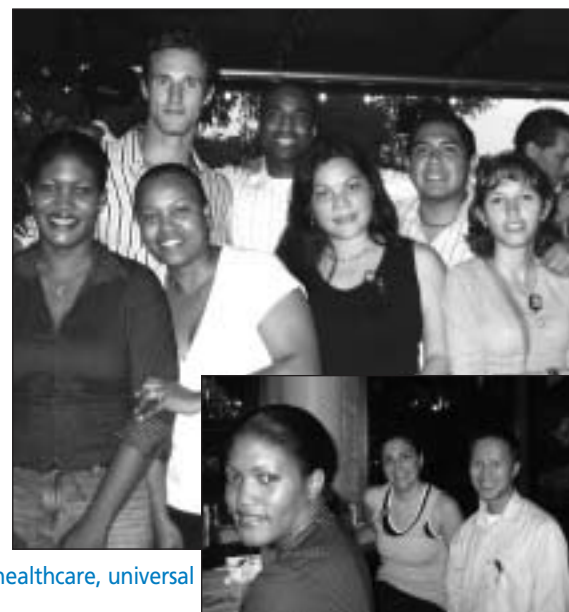
... Children's Hospital Oakland; Santa Rosa; and Miami, Florida, used the movie Sicko as a way to jump start their efforts for access to community healthcare, universal coverage, and care for uninsured children.

around at noon conference for several days, and spoke with residents about the program. "People were really supportive, signed the petition and thought it was a good idea. Some people were not aware of the issue, and were glad to learn about it. Our program director signed it as well. It's not a very controversial issue among doctors, expanding health coverage for children," he said.